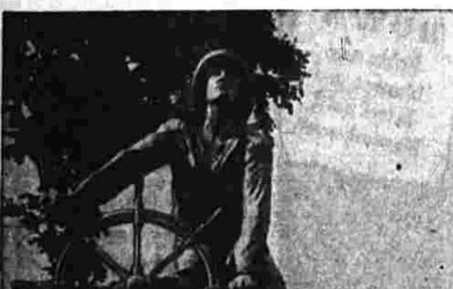
DOWN TO THE SEA —To the memory of martyrs lost at sea, a fisherman grips the wheel at Gloucester, Mass., where a hushed throng of 15,000 recently attended the annual memorial service. Above, men from the U. S. navy join the Gloucester friends and relatives in paying tribute at the famous statue to five men lost last year's tribute at fishing port.