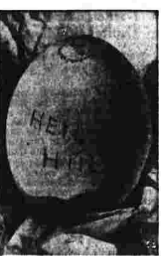
HARD-BOILED —An investigation of Nazi egg-laying traced this egg, hatched by an English prospector near Alderhot, to Vandenberg at the Danish-German border, where Nazi sympathizers are strong. Unbelievable link was used for the setting.